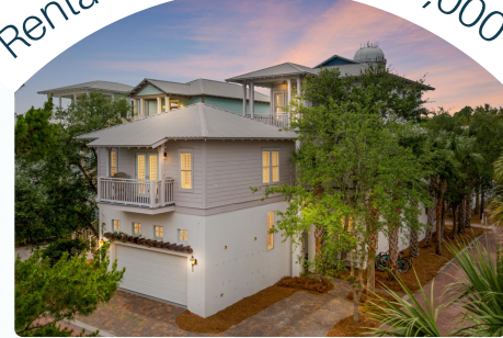
5BR 5BA 2,736SqFt 48 Surfer Ln, Inlet Beach $2,295,000