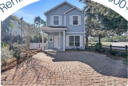
3BR 2.5BA 1,256SqFt 65 St Vincent Ln, Inlet Beach $779,000