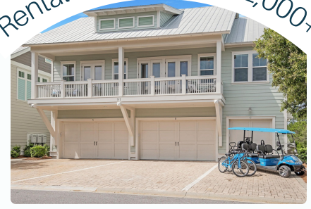
2BR 2BA 1,182SqFt 91 Milestone Drm Unit C, Inlet Beach $950,000

Listing data provided by ECAR MLS, accurate as of 6/30/22