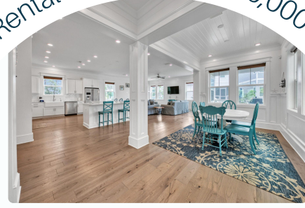
4BR 4.5BA 3,126SqFt 38 E Crabbing Hole Ln, Inlet Beach $2,300,000