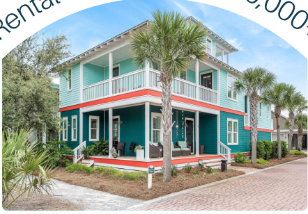
5BR 4.5BA 2,732SqFt 36 Moonlight Beach Ln, Inlet Beach $1,899,000