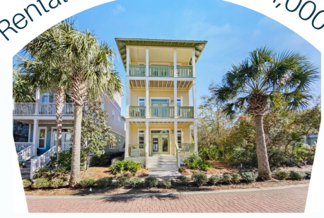
5BR 4BA 2,600SqFt 44 Sand Flea Dr, Inlet Beach $1,870,000