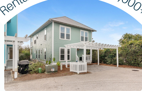
5BR 3BA 2,105SqFt 254 Cottage Way, Seacrest $1,850,000