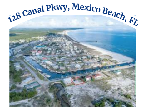
Lot - .15 Acres - On Canal